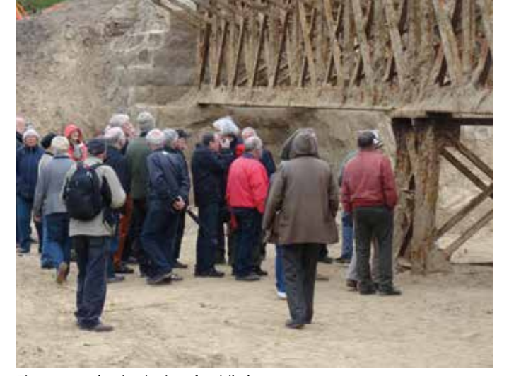
The excavation had a lot of public interest.

The bridge was laid open in two stages. First the horizontal upper part was uncovered, sandblasted with 3000 bar, grinded, primed and then painted (with brushes in all nooks and crannies). During the sandblasting the entire bridge element was wrapped to prevent the old lead heavy paint in falling into the creek underneath. In mid-August the next phase was initiated. The supporting bridge towers were uncovered and the restauration procedure repeated. Later the bridge was provided with handrails and a pedestrian bridge in robust Azobe wood.