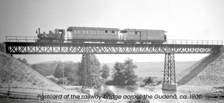
Postcard of the railway bridge across the Gudenå, ca. 1900.