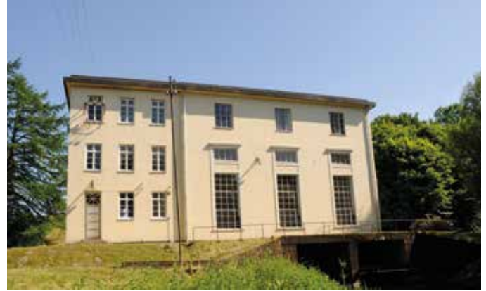
Vestbirk Hydroelectric Plant.

In 1850 at Vestbirk the power of water was harnessed through mill wheels and later redirected as pulling power for the spinning, weaving and sowing machines of the recently newly Yarn and Hosiery Factory – a business which at its peak employed more than 100 workers. A large fire demolished the property in 1920, but this led to innovation. The industrialization demanded more and more electricity, not just for the local factory but the surrounding community as well. In the light of World War I it became obvious that an industrial production based entirely on deliveries of coal and diesel was no longer profitable, which